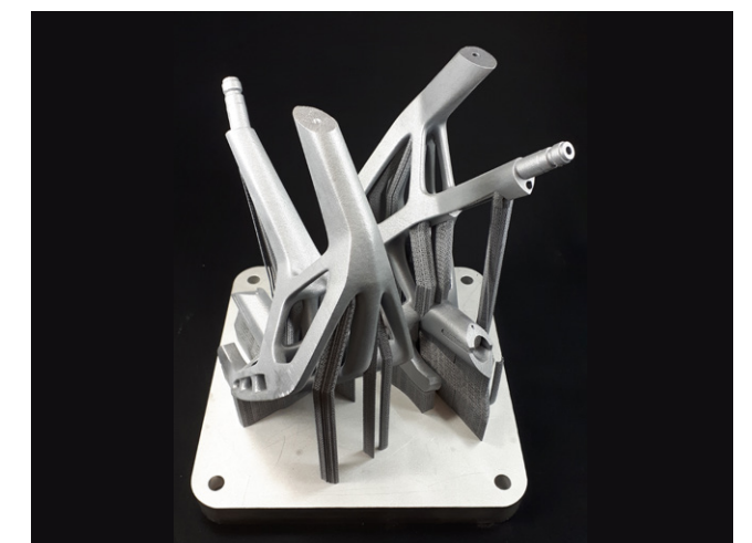
FIGURE 2 Rear wing bracket