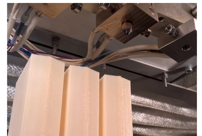
FIGURE 3 Custom built specimen in a build chamber of an FDM machine