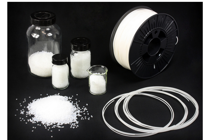
FIGURE 1 Granules and filaments for FDM processing

Additionally, the influences of fibre reinforcement was investigated regarding processing suitability and part properties. For the production of the short fiber reinforced parts and specimens, short-fiber reinforced filaments were processed. The process properties and the resulting part properties were investigated with regard to fiber-specific influences. Additionally, the effects of different process parameters on the fiber orientation and mechanical part properties were investigated.