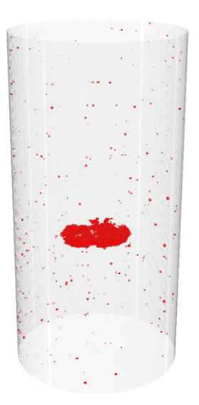
FIGURE 3 Computed tomography scan of Ti6Al4V sample